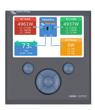
Color Control GX, showing a PV application

When connected to the Ethernet, systems with a Color Control GX or other GX device can be accessed and settings can be changed remotely.